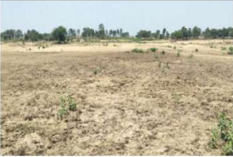
Water structure location (before rains)