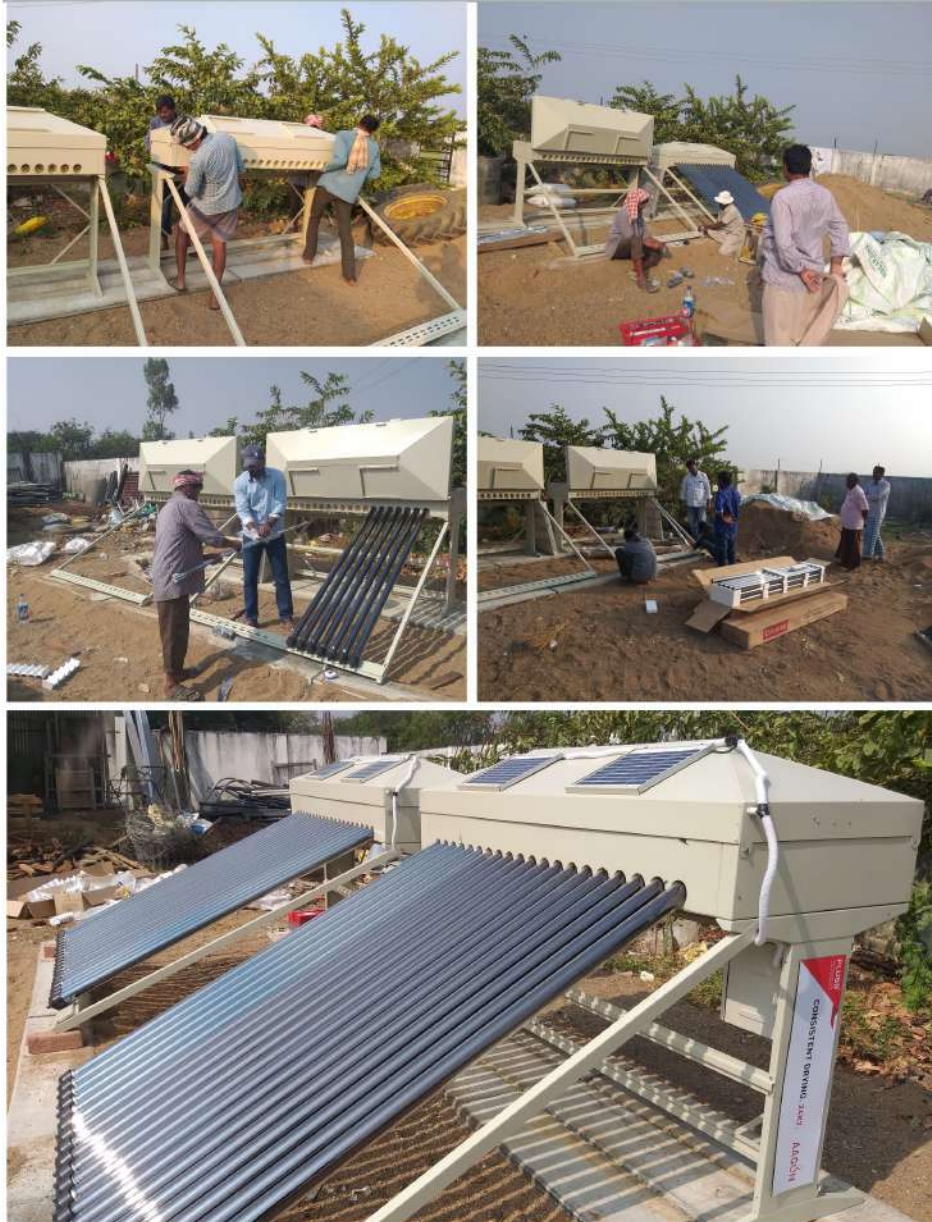
AAGUN dryer installation