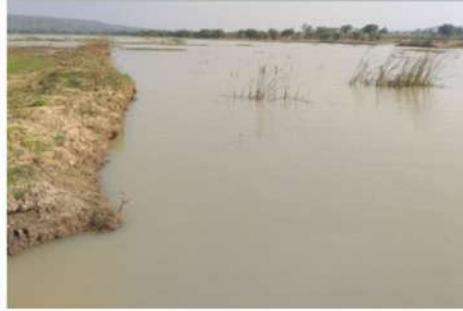
Low lying area filled with water