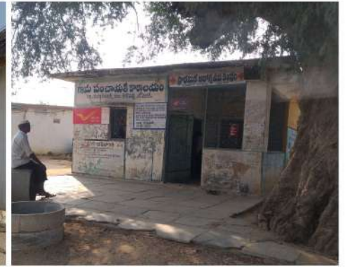
Village child-care centre