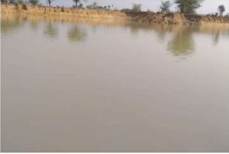
Low lying area-part of it deepened