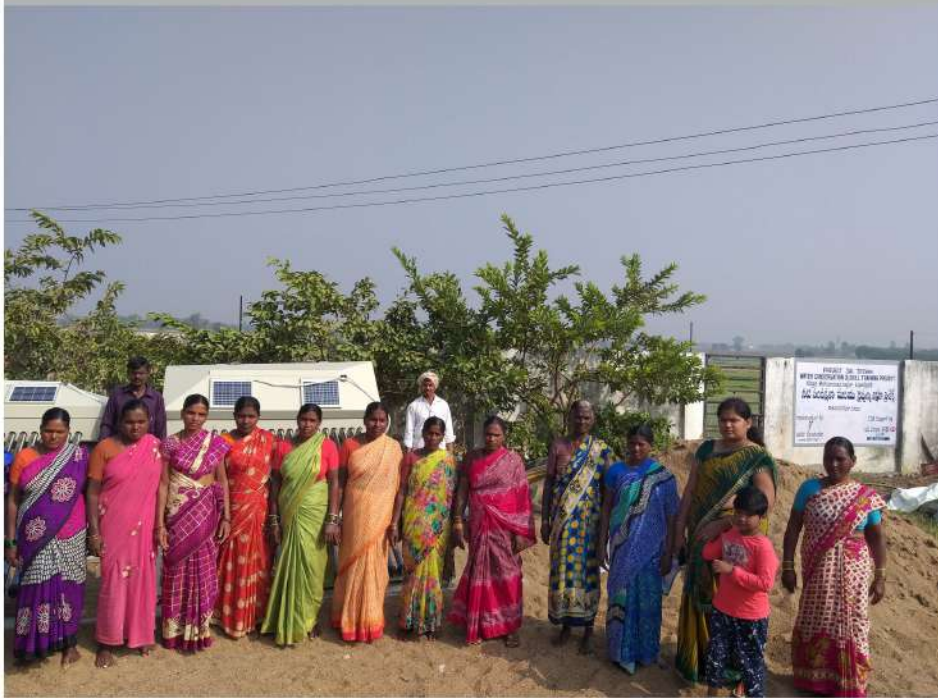
Sarpanch with SHG members in front of the dryer