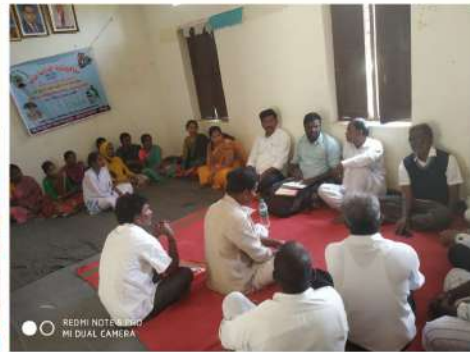
Glimpses of existing village facilities