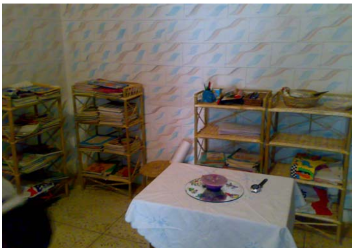
The library – A place to explore through books

One Resource Centre for learning located in village Ghata with 60 children and 4 teachers and 4 volunteers .