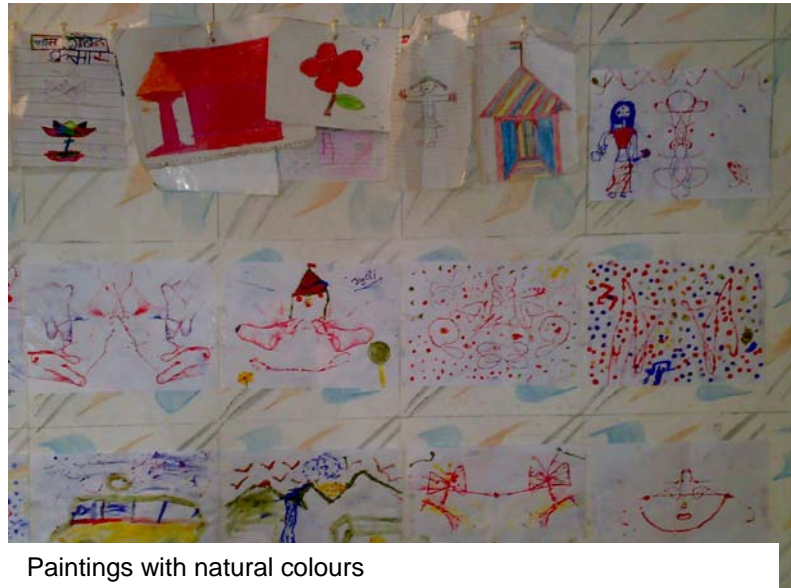
Paintings with natural colours

The programme's central strategy is fostering peer involvement through volunteer teaching. Classes are held 6 days a week except Sundays. Market linkages are being sought for the tailoring unit and art and craft products. The