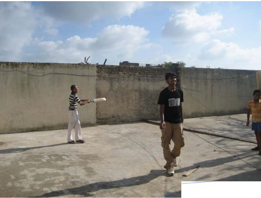
Cricket Game In Progress – Young volunteers and students of Advit Centre