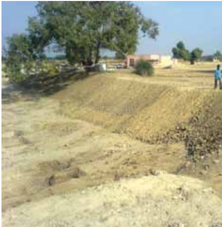
Figure 3 A: Kirat pura - Before Rains