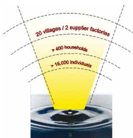
Figure 1: Impact of the Project