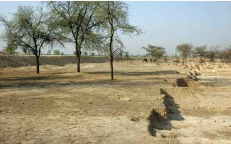
Figure 5 A: Chandwas - Before Rains