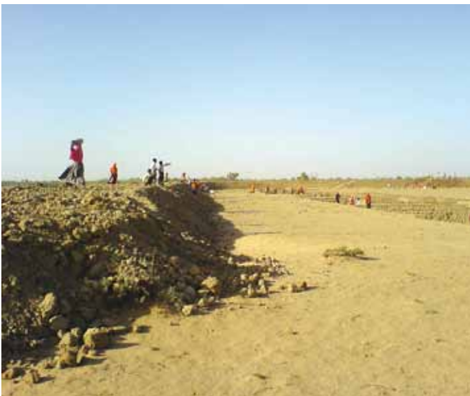
Figure 6 A: Navalkishorepura - Before Rains