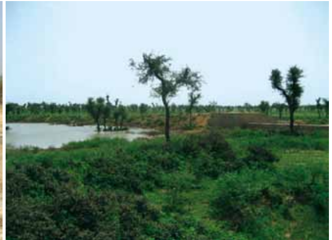
Figure 5 B: Chandwas - After Rains