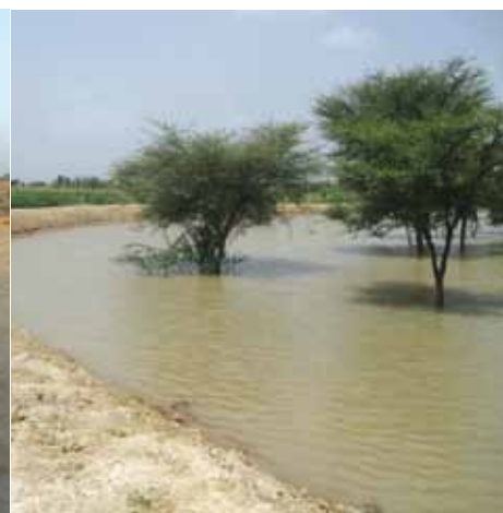
Figure 2 B: Bhimpura Village - After Rains