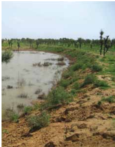
Figure 4 B: Chandwas - After Rains