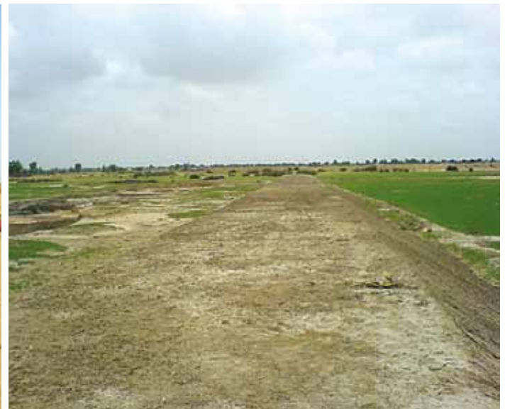
Figure 6 B: Navalkishorepura - After Rains

models for weaker sections of the society.