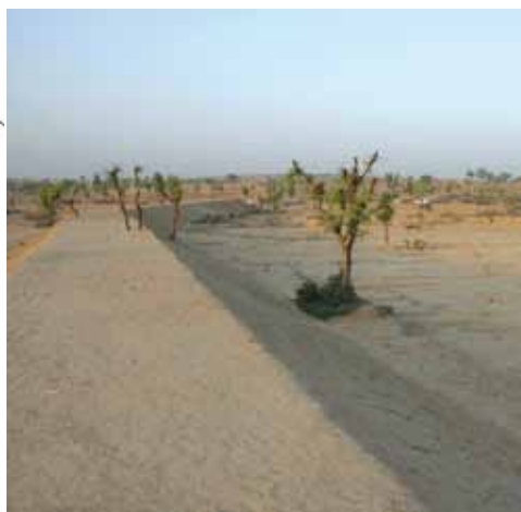
Figure 2 A: Bhimpura Village - Before Rains