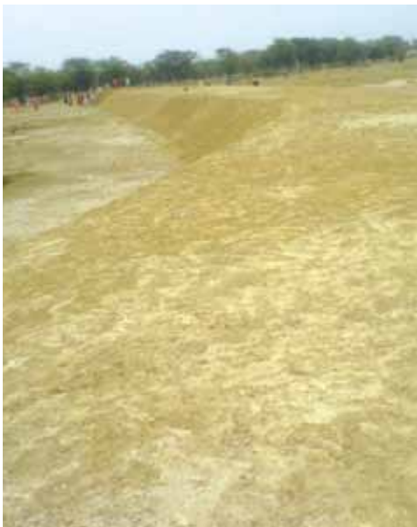
Figure 4 A: Chandwas - Before Rains