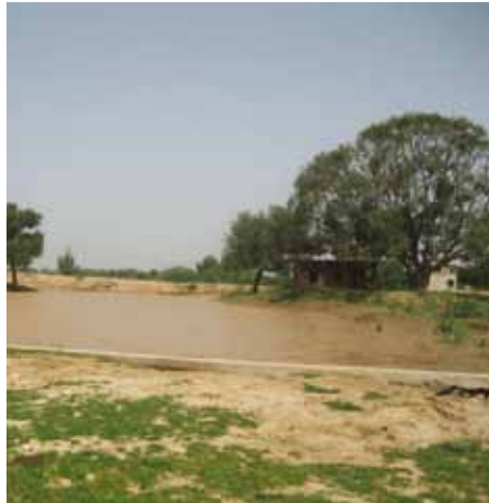
Figure 3 B: Kirat pura - After Rains